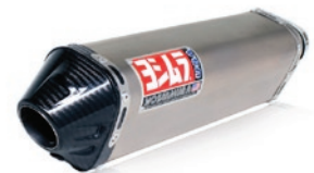
1406077 TRC Titanium / Carbon Endcap