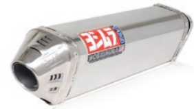
1406075 TRC Stainless / Stainless Endcap