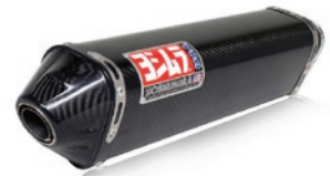
1406072 TRC Carbon / Carbon Endcap